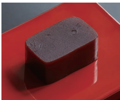
Yoru no Ume