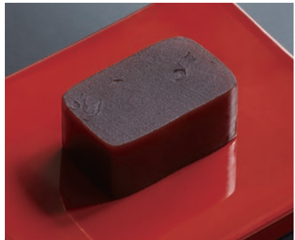
Yoru no Ume